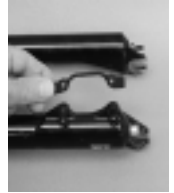
Step C-2 Fork Adapter