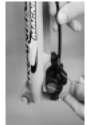
Step C-7 Stringing Cable