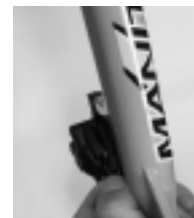
Step B - 2 Removing Pads

Parts are warranteed for a period of 1 year to be free from defects in material and workmanship, and this express warranty is in lieu of all other warranties, expressed or implied by law or otherwise. Claimed defective parts may be returned to us for determination of defectiveness during the normal service period and will be replaced, credited or repaired at our option without charge. Every claim on account of defective material or workmanship or any other cause must be made in writing or deemed waived by the customer.