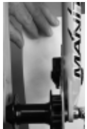
Step C-14 Checking Gaps