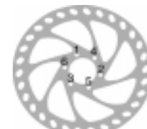
Step B - 3 Torqueing Sequence